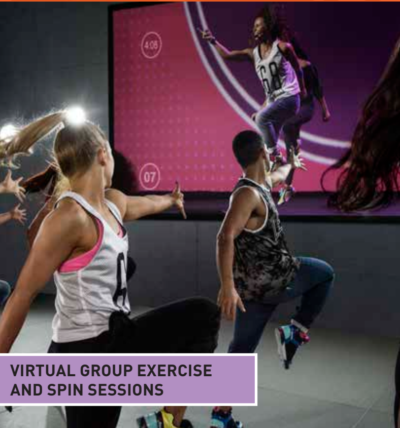
VIRTUAL GROUP EXERCISE AND SPIN SESSIONS