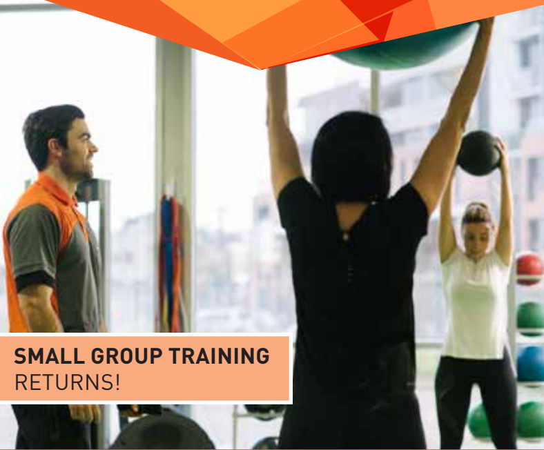
SMALL GROUP TRAINING RETURNS!