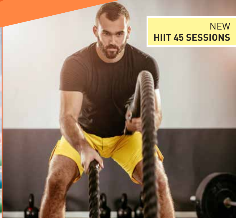
NEW HIIT 45 SESSIONS